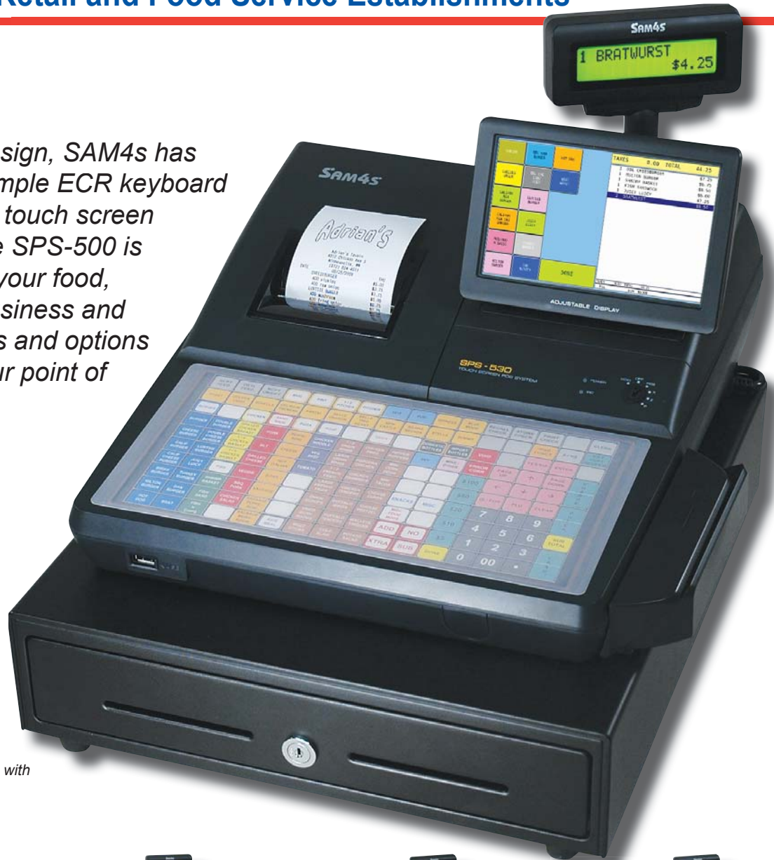
SPS-500 Series Hybrid ECRs Shown with Optional Card Reader

Featuring a hybrid design, SAM4s has combined fast and simple ECR keyboard entry with an intuitive touch screen operator display. The SPS-500 is easily configured for your food, beverage, or retail business and provides the functions and options you need to meet your point of service needs.