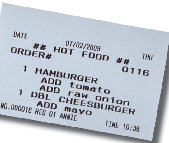
Kitchen requisition printed by the SPS-530 80mm receipt printer shown 75% actual size.