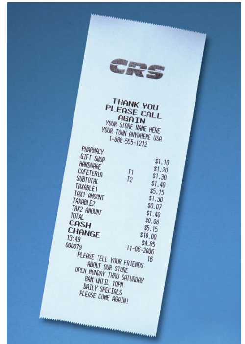
Thermal Receipt Shown 60% Actual Size