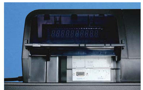
One Standard RS-232C Port Hidden Behind a Convenient, Easy to Access Door