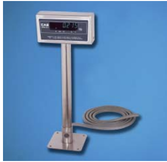
Optional Remote Pole Display