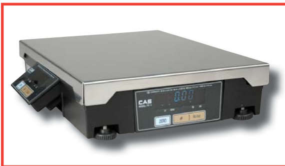
Standard Left-Side LED Customer Display