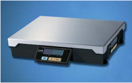
Easy to Read Tilt Display